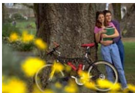
Educational goals and dreams can be obtained in Central Oregon

The remaining psychology credits may be taken at the 300 or 400 level.