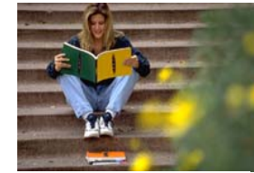
Education opens many doors to new opportunities.

A bachelor's degree is seldom sufficient qualification for professional work in psychology; at least a master's